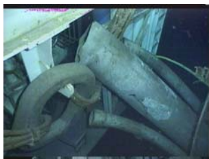
CLOSE UP OF RISER JOINT NO. 1