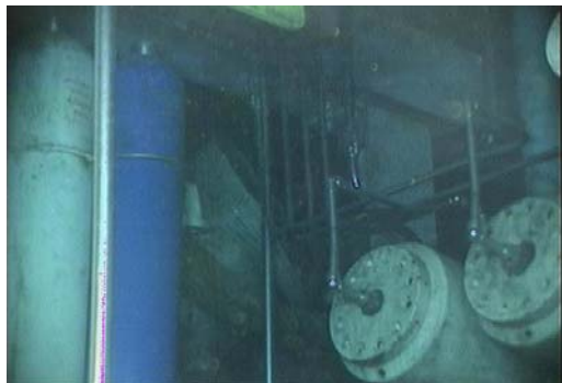
RISER JOINT NO.1 LAYING AGAINST BOPS