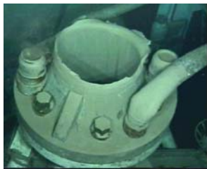
TOP OF LOWER MARINE RISER PACKAGE (LMRP) WHERE JOINT NO. 1 HAD BEEN CONNECTED